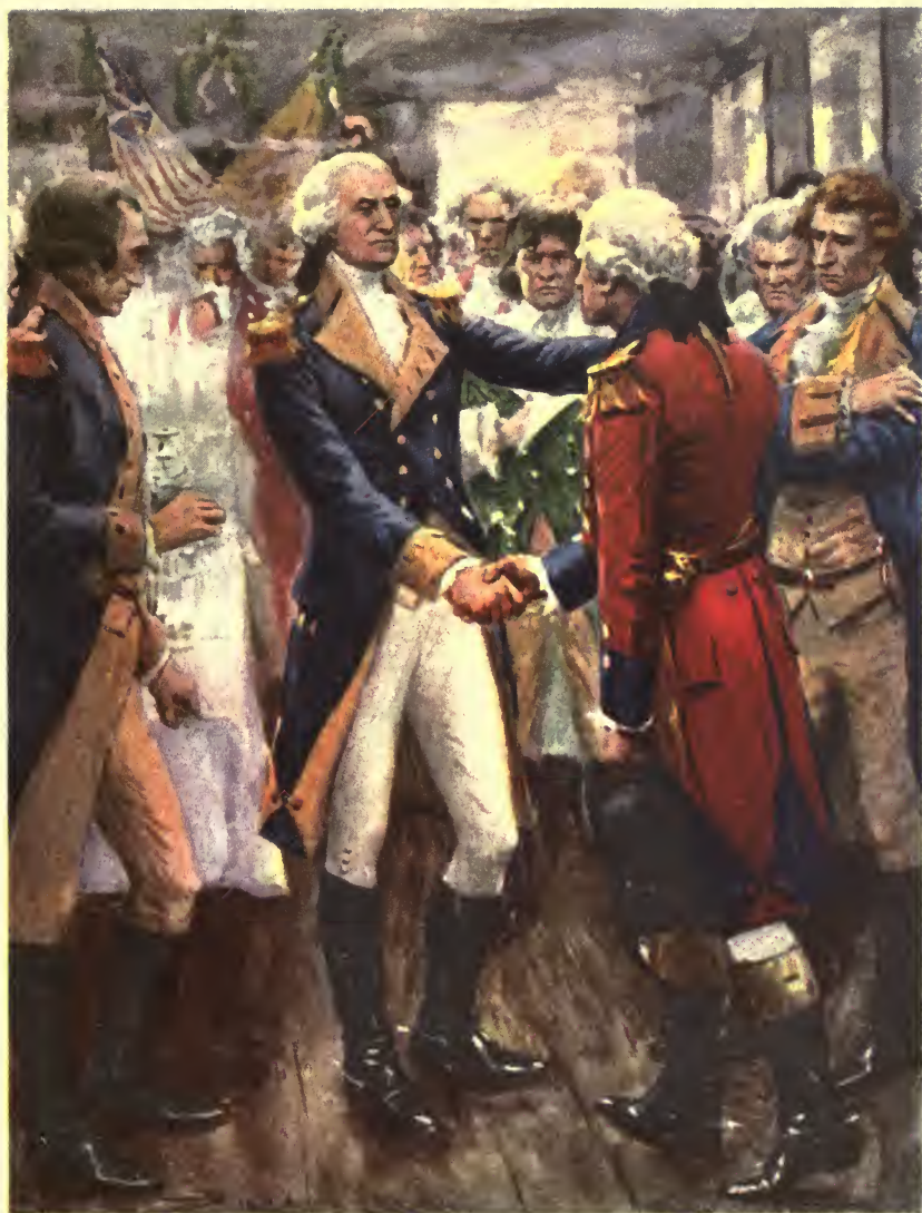
WASHINGTON TAKING LEAVE OF HIS OFFICERS

And thus one after the other his officers silently said good-bye, no one of them trusting himself to speak.